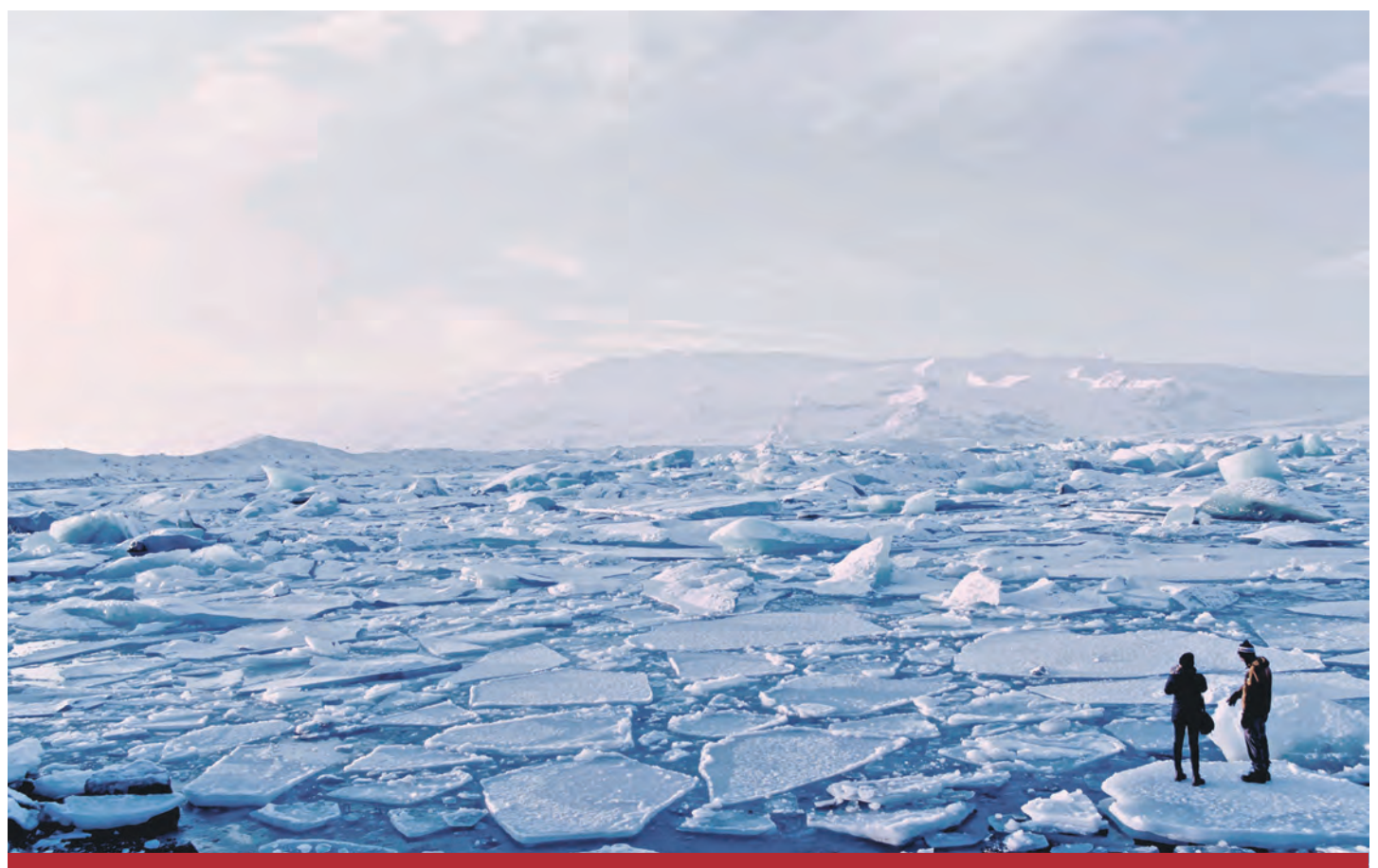
The details on governance and strategy in a CDP response often provide valuable insights to the Boston Common Asset Management team.

and Air Liquide about their carbon footprints and how they work to help other companies reduce emissions. This is part of our 'ecoefficiency' initiative that we are rolling out with companies to reduce their energy and water use, and eliminate waste, as a next step for companies and investors seeking to address climate change."