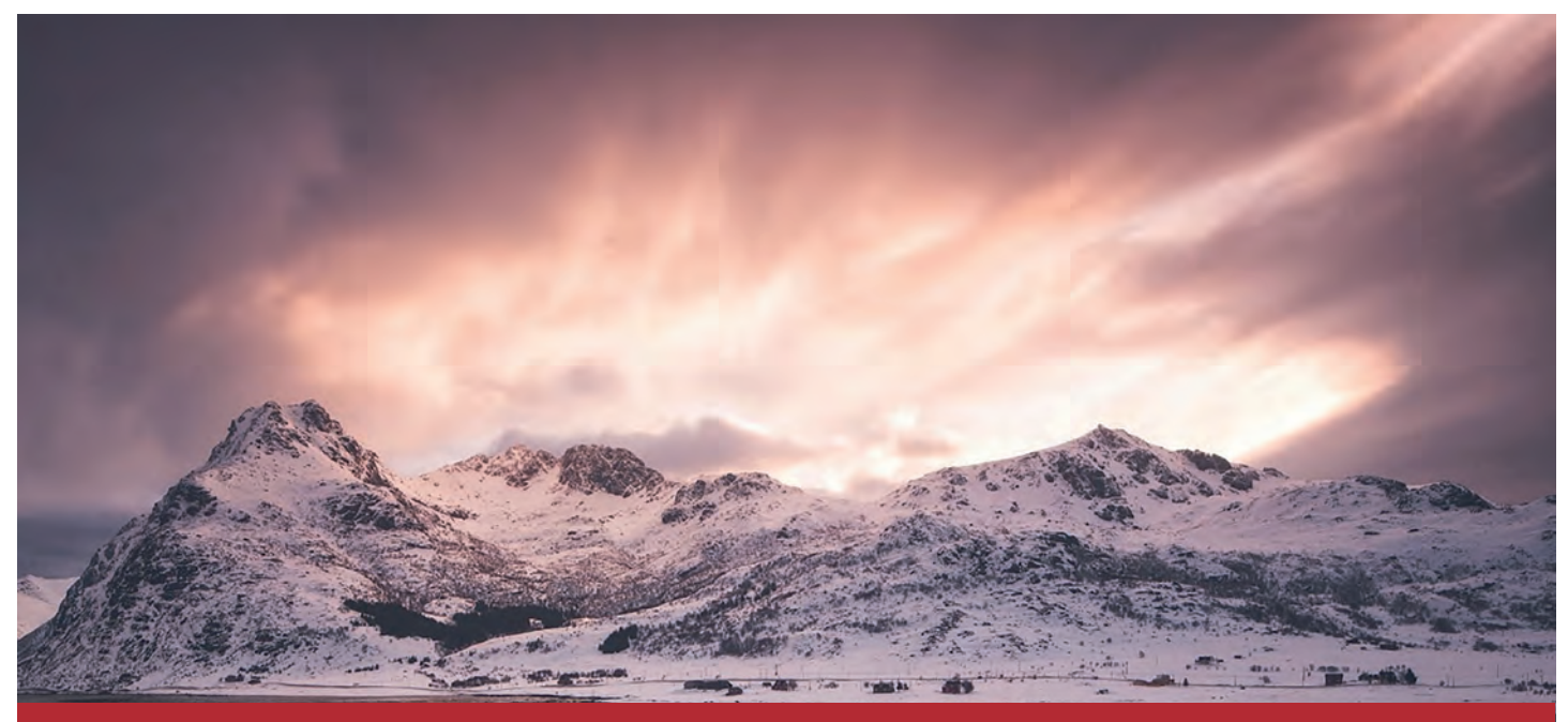
By improving the performance of {\rm CO_2} intensive companies, KLP seek to secure better returns from passive investments

The CDP database is uniquely global... Giving CDP an important future role as emissions reporting continues to evolve.