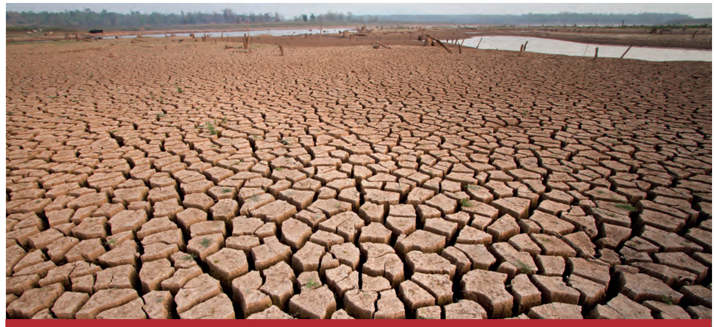
CDP consulted with Environment Agency Pension Fund on the formation of their highly-acclaimed Policy to Address the Impacts of Climate Change.